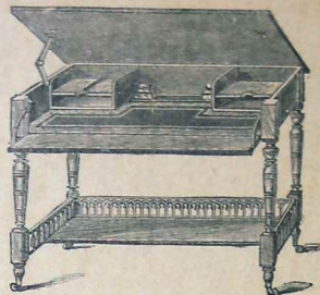
OETZMANN'S PATENT WRITING TABLE, £2 19s. 6d.

S, FURNITURE, BEDDING, DRAPERY, FURNISHING IRONMONGERY, CHINA, GLASS, &c.