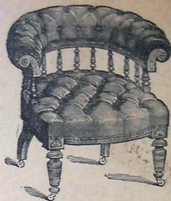
Very Superior Library, Smoking or Dining-Room Chair.

Registered Cable Address: "OETZMANN, LONDON." A.B.C. Code used.